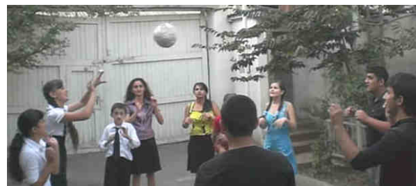
Below: Break-time at the Centre

As well providing free courses, the centre focuses on small group teaching to maximise the opportunities for individual learning. The staff also strives to encourage and develop the children's social development outside classes through games and other recreational break-time activities & challenge their thinking through various one-off projects—e.g. an environmental action day. For those children who have the opportunity to continue their local school education CARD can provide study areas and additional support and advice to enable them to do well at school. For some of the students this is the first opportunity to receive some sort of practical education.