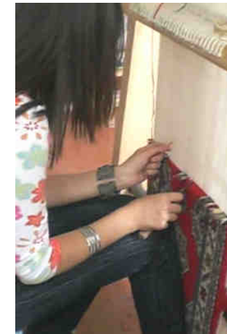
Left: A student in CARD's carpet making class